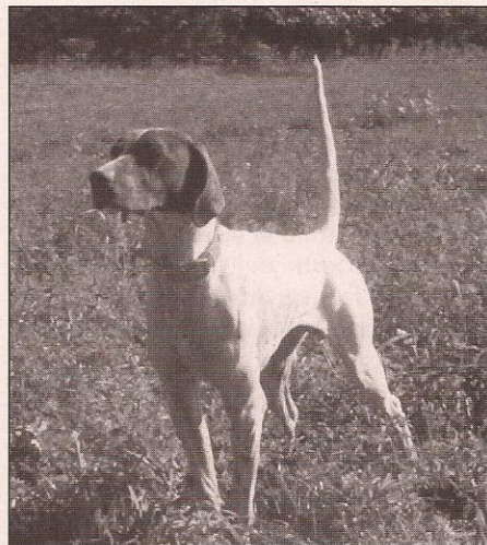
MY COUSIN VINNY First in the Amateur Shooting Dog Stake