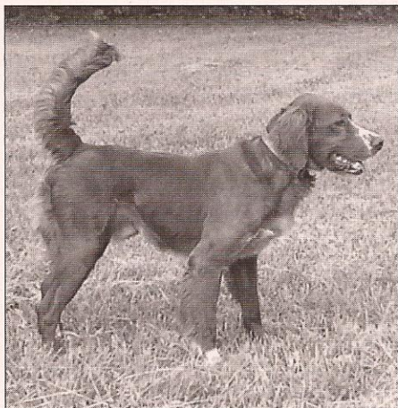
KING CORMAC Second in the Open Shooting Dog Stake