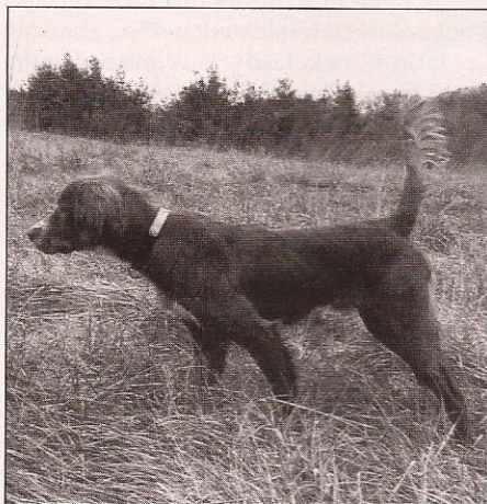
TOUCHSTONE First in the Ken Graham Amateur Shooting Dog Classic