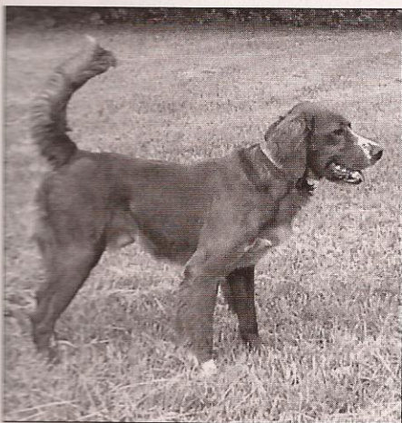
KING CORMAC First in the Open Shooting Dog Stake